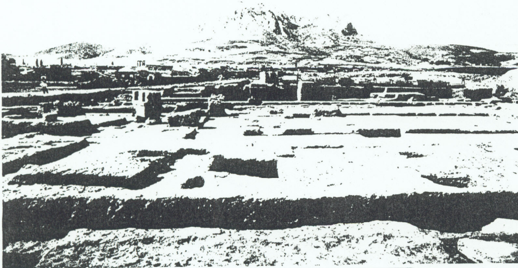
The Asclepeion of Ancient Corinth. The temple from the North.