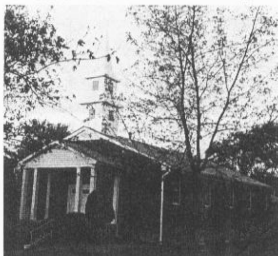
NEW BETHEL MISSIONARY BAPTIST CHURCH