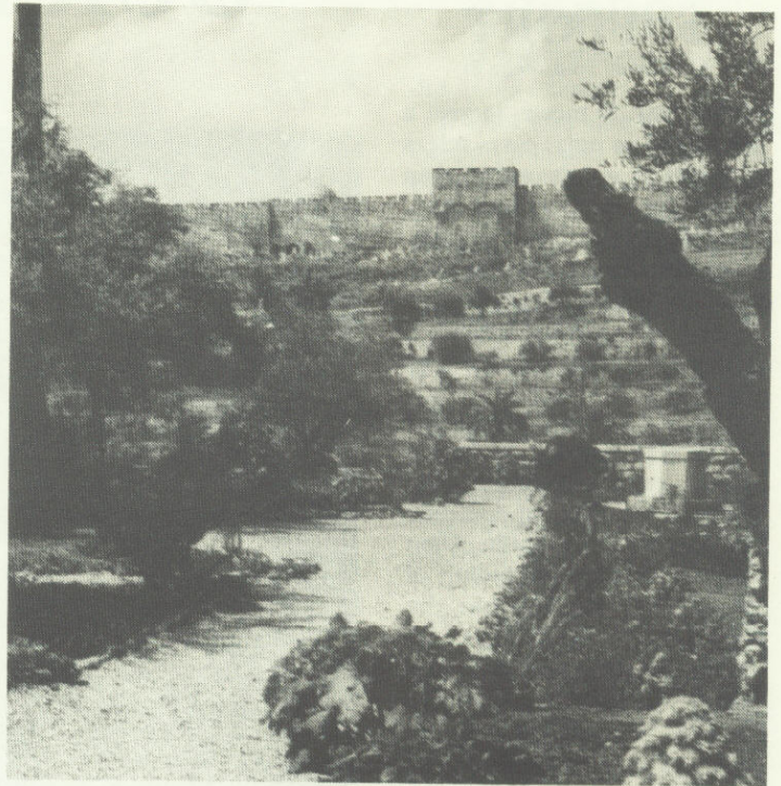
Garden of Gethsemane

The next day as we watch the Greek Islands disappear from view while we wing our way homeward to the welcome reunion with loved ones at the Nashville airport, we can confirm that as the brochure on the trip to the Holy Land and Greece promised, this has truly been "THE TRIP OF A LIFETIME!!"