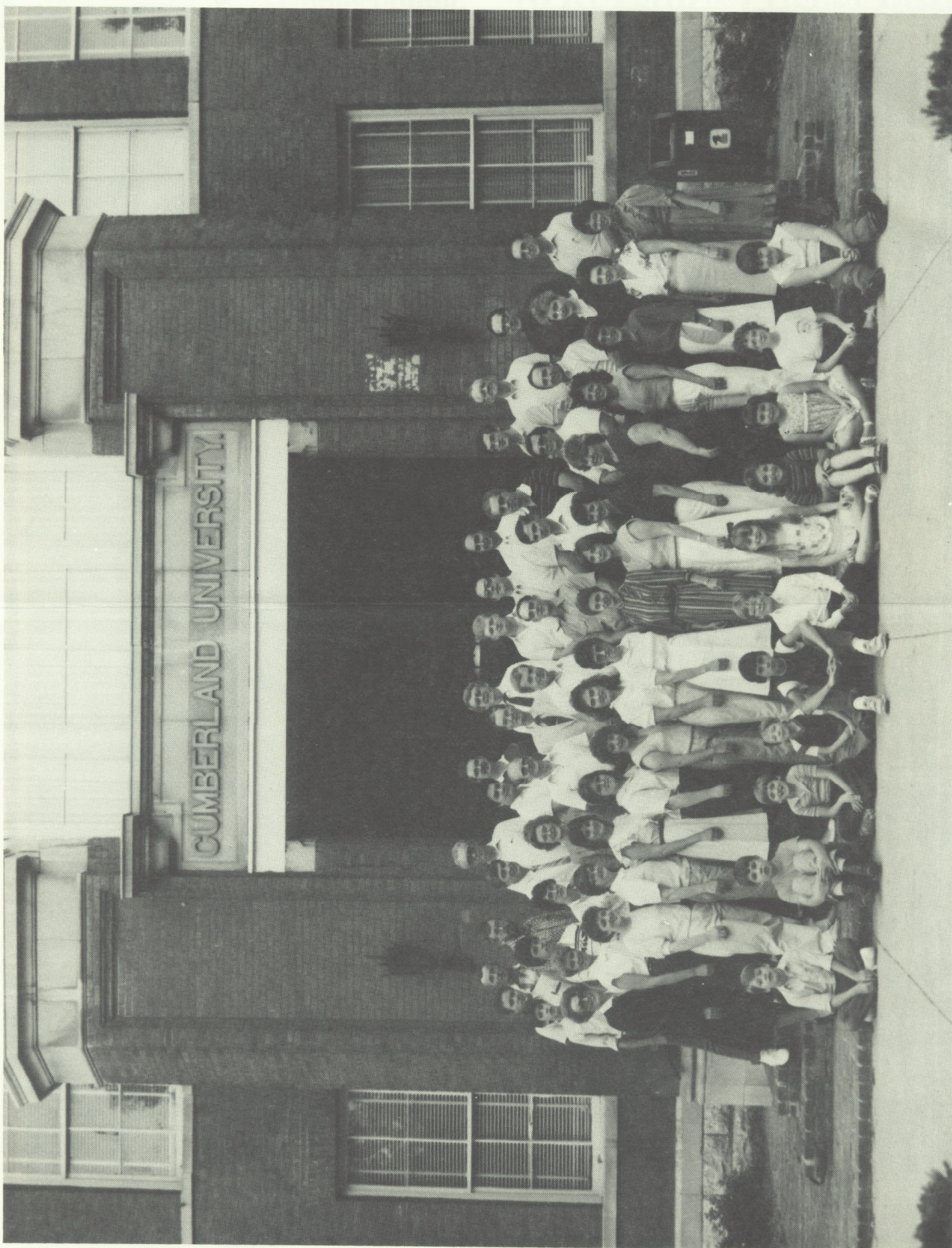
Night students and faculty of Cumberland Valley School of Gospel Music, Cumberland University, Lebanon, Tennessee, June 1985