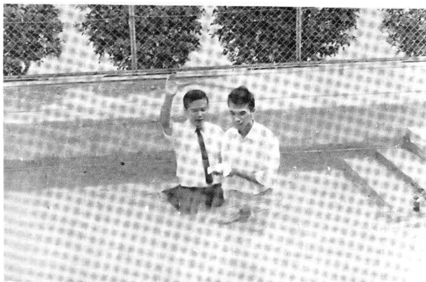
Southwestern District Baptist Association To Meet October 8, 9, 10

Subjects to be discussed during the three-day session include Missions, Christian Education, Sunday Schools, Prayer Meetings, Church Discipline, Finance, Temperance and Morality.