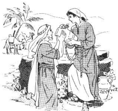
Rebekah gave Abraham's servant a drink from her pitcher. GENESIS 24: 1-28

God is light, in Him there is no darkness. God is love, in Him there is no hatred. God is peace, in Him there is no strife. God is laughter, in Him there is no sorrow. God is truth, in Him there are no deceptions. God is mine, what else can I say?