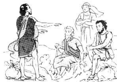
John preaches repentance. MATTHEW 3:1-12