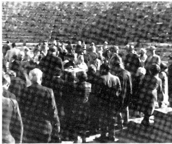
Tour Group at Salamis, Cyprus