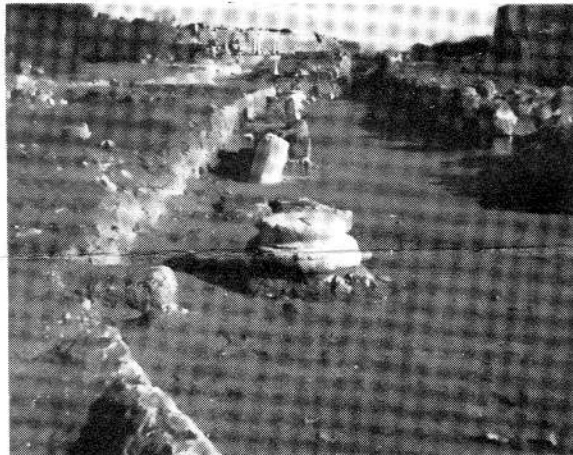
Ruins at Caesarea.