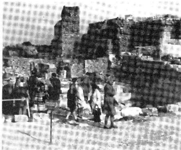
Ruins At Salamis, Cyprus