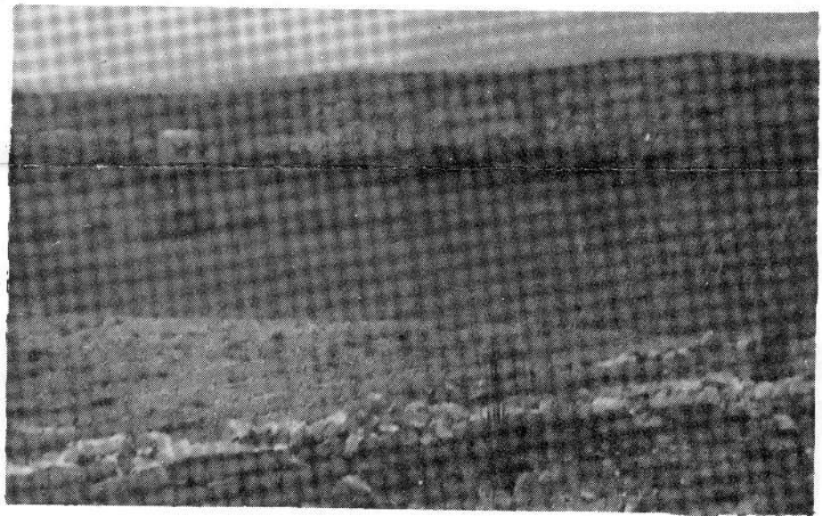
The Shepherd's Field near Bethlehem, Judaea